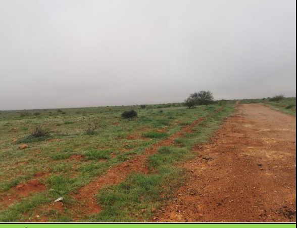
Farm acceess road to site