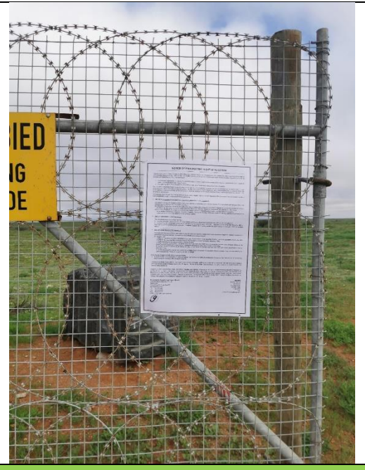
Proof of site notices