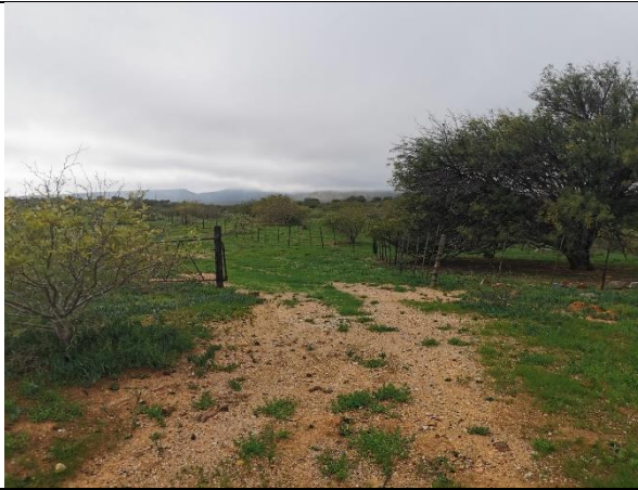
Landcover surrounding small mining area