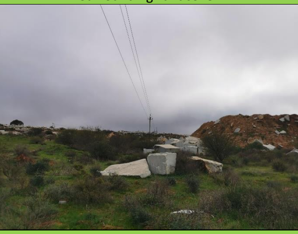
Eskom Power Line